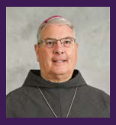
Dear Sisters and Brothers in Christ,

Catholics are people committed to the beauty of the faith. We affirm the great truths of the Gospel as we speak and seek the truthfulness about all things, especially God's love for our world.